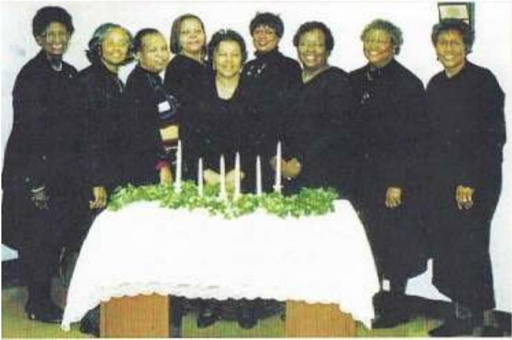
Lambda Omega Upsilon Chapter Celebrate Founder's Day